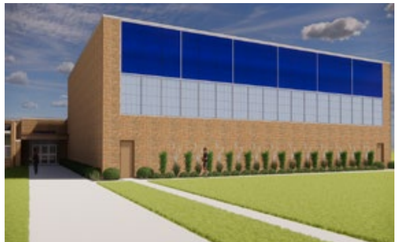
Gymnasium/multi-purpose room addition