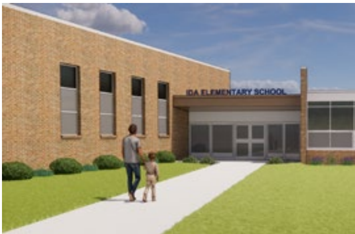
New secure entrance