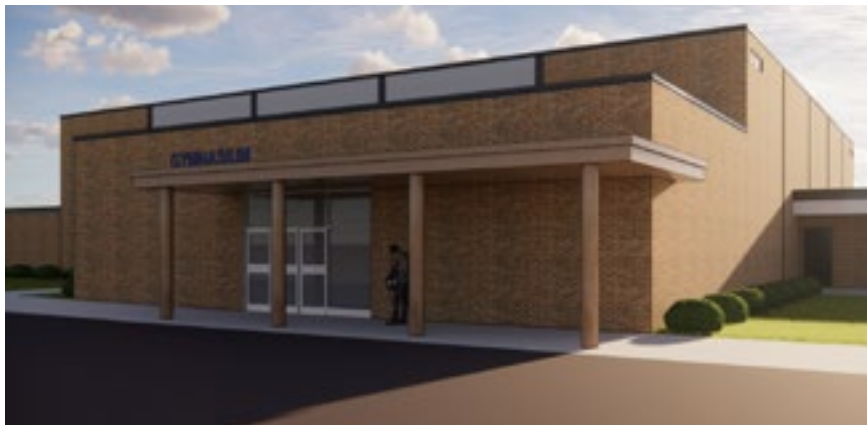
Addition to the high school gym