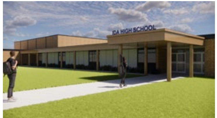
New secure entrance