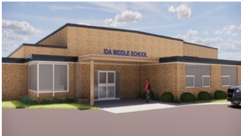
New secure entrance