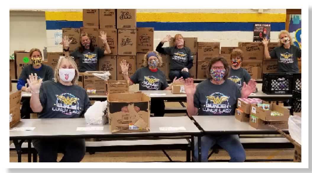
Our Amazing Food Service Staff

Instructionally, we are staying on track and evaluating the best modes of instruction. In 2018-2019 our scores at the elementary, which are measured at the end of 4th grade, dropped slightly and we received a low grade in the comparison category. Our comparative grade was determined comparing us to similar schools around the state, none from our county. You can go to the Michigan Department of Education to see those schools. MDE We studied the reasons why our scores slightly dipped and addressed them. The elementary performance was still high enough to receive Reward School status which was