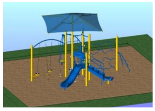
Paid for by the PTA

Thanks to the success of our annual Read-a-Thon, enough funds were raised to purchase the pictured playground equipment. Students were allowed to vote on which color combination they liked best; the picture shows the winning combination. The installation is scheduled to begin the week of August 14th with the hope that it will be complete for the new school year. Please be cautious during installation when enjoying the rest of the elementary playground equipment, but also revel in anticipation of the new addition! In addition to the funds raised, the success of the Read-a-Thon shows in our students' enthusiasm to read at school and for pleasure. Please encourage reading year-round; this will lead to a much smoother educational experience and enjoyment outside school.